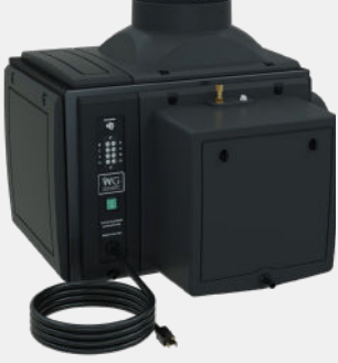
Optional Integrated Humidifier *Patent Pending

units come installed with service ports, appropriate pressure switches, and a refrigerant sight glass to allow for faster and more efficient maintenance .