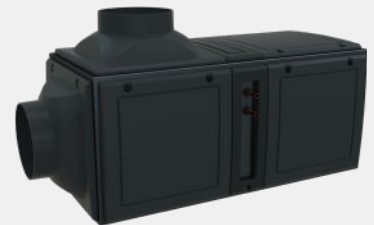
Water-cooled systems available. *Patent Pending

Wine Guardian Pro units come installed with service ports, appropriate pressure switches, and a refrigerant sight glass to allow for faster and more efficient maintenance .